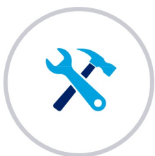
Expand installation services