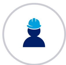
Drive Pro penetration

Lowe's is an omnichannel retailer whose core priorities are to provide an excellent customer experience, create a great place to work for our associates, and improve our communities, which we believe will create long-term, sustainable value for our shareholders. In fiscal 2020, we implemented our Total Home strategy, which reflects our commitment to provide a full complement of products and services for professional customers (Pro customers) and consumers alike, enabling a Total Home solution for every project across the home. Our Total Home strategy has the following five pillars: