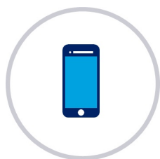
Accelerate online business